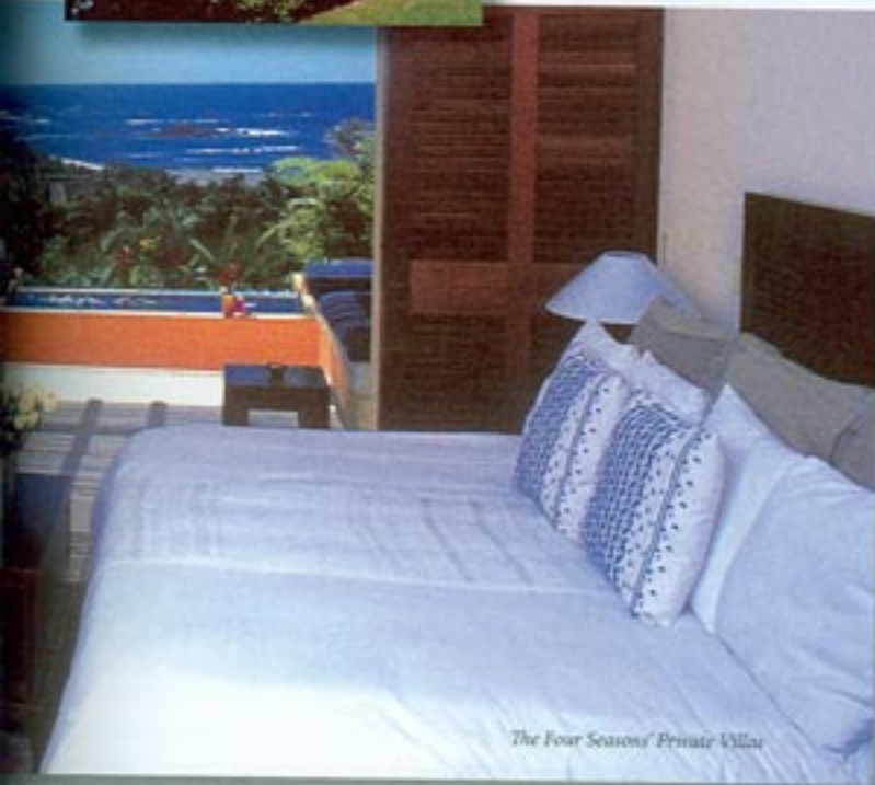
The Four Seasons' Private Villas

These very luxurious villas sit overlooking the Four Seasons Resort and the ocean below. They are very secluded and when swimming in your own infinity pool its easy to forget this is actually a resort and not simply your private residence. But of course all the resort amenities are very tempting.