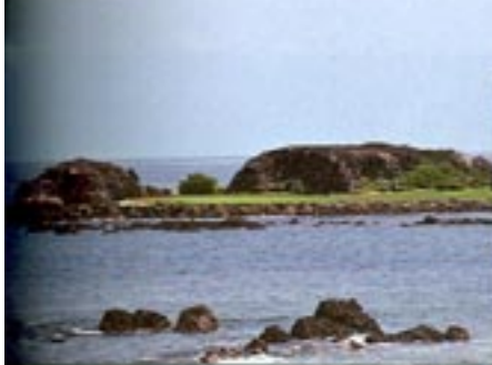
Being Punta Mita's signature Jack Nicklaus Golf Course.