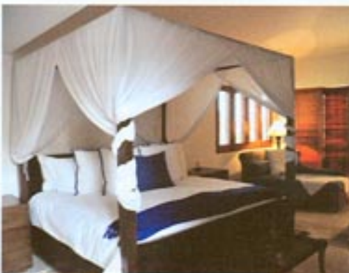
A personal chef completes the luxurious appointments at Las Palmas de Punta Mita.