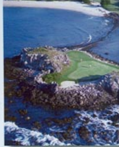
Other Punta Mita residences.