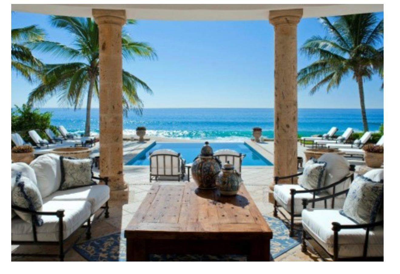
<u>Villas Del Mar from Del Mar Escapes</u> <u>Features (http://www.elitetraveler.com/travel/travel-news/villas-del-mar-from-del-mar-escapes)</u>