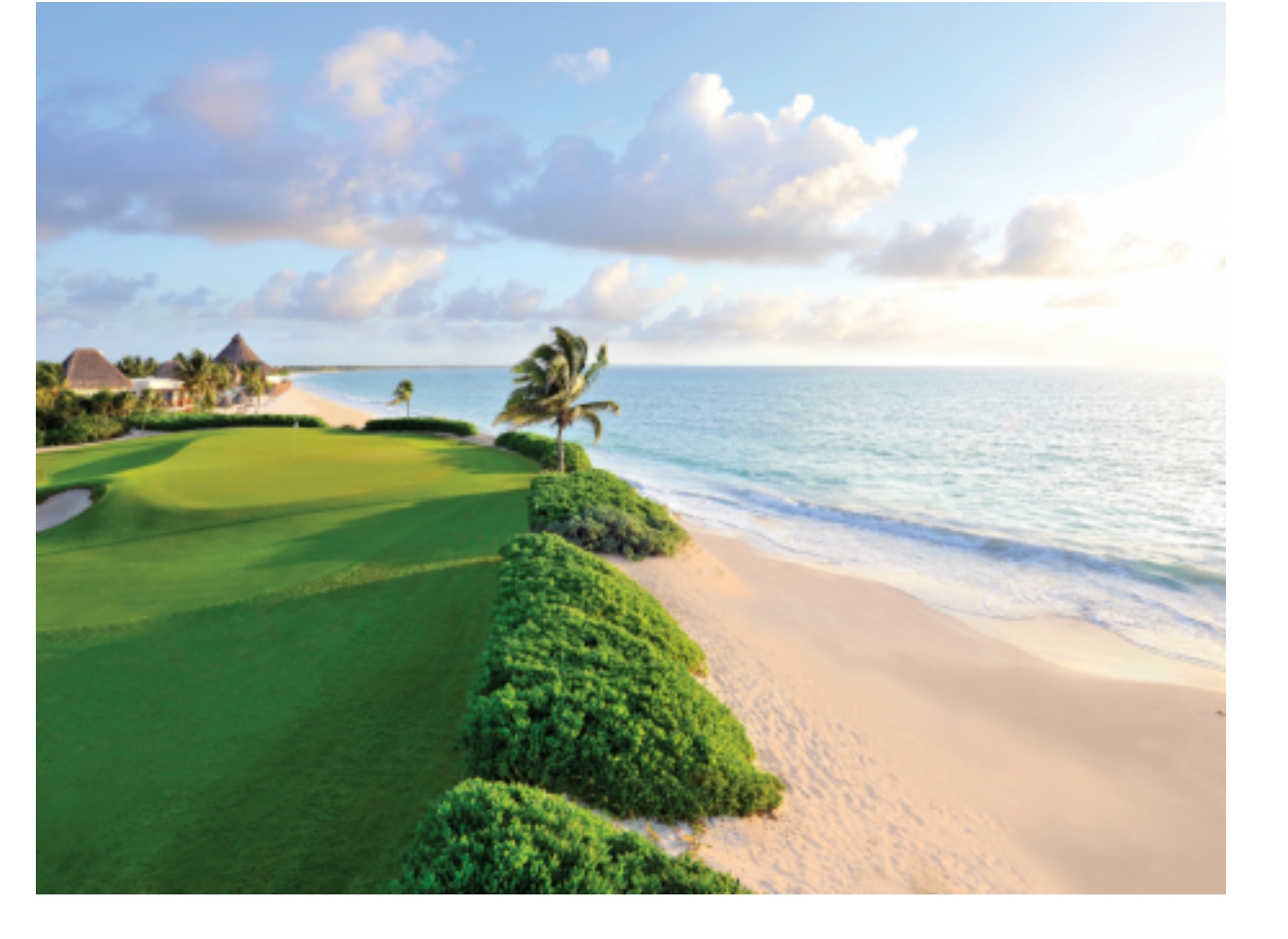
Fairway to Heaven: Mexico's Best Golf Features (http://www.elitetraveler.com/features/52113)

Enter your email address and receive our weekly e-newsletter