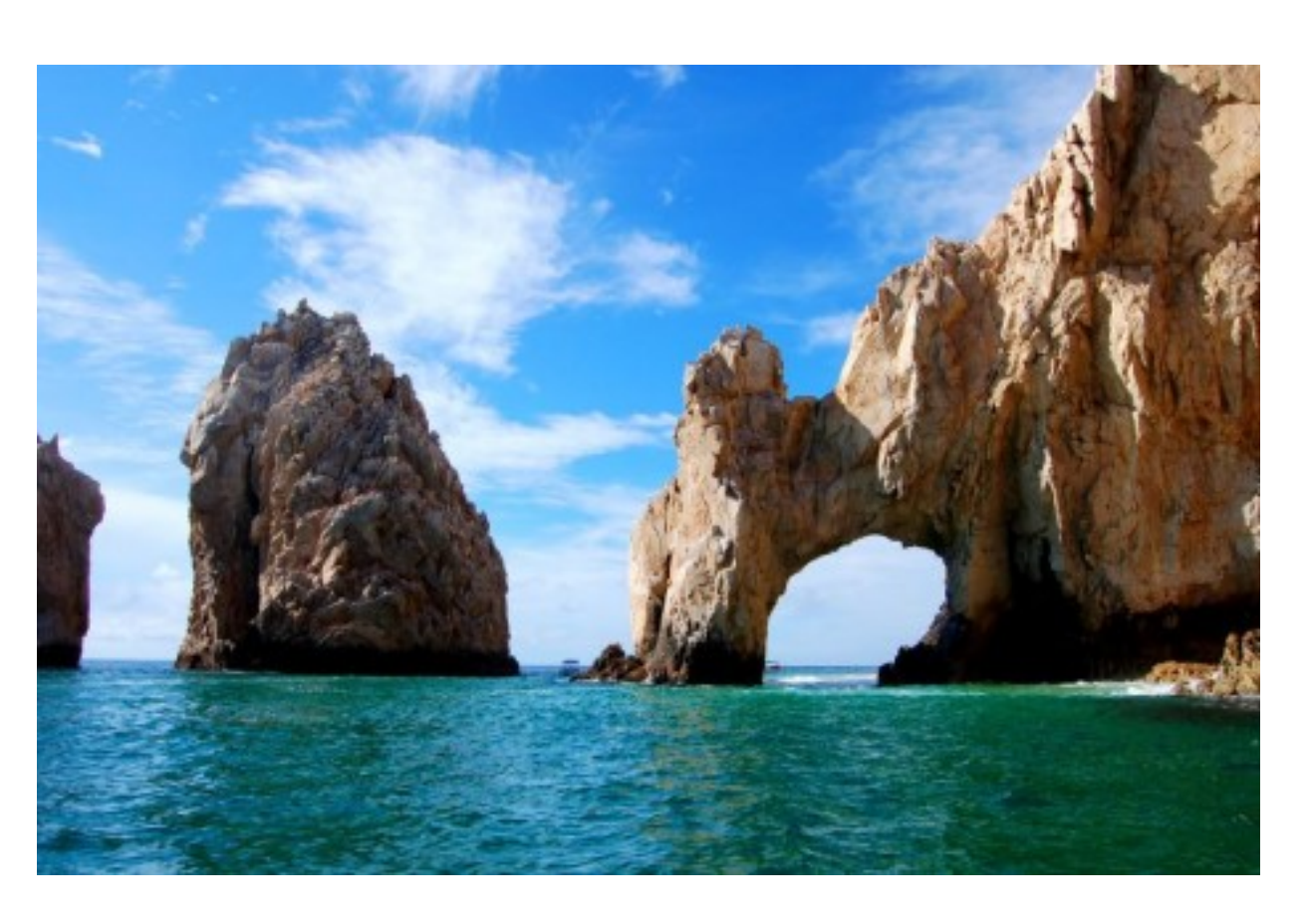
<u>Los Cabos: The Best of the Best</u> <u>Features (http://www.elitetraveler.com/travel/destination-guides/mexico/los-cabos-best-of-the-best)</u>